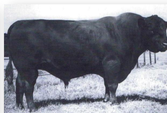
EMULOUS PRIDE 70

Reg. AAA 5037029 Emulous Master 209, the sire of Spur Emulous Master, was one of the most important sires in the history of Spur Ranch. He was the only bull in the world at that time to be a third generation 100% CMS sire. He traced twice to the legendary Gaines Lady.