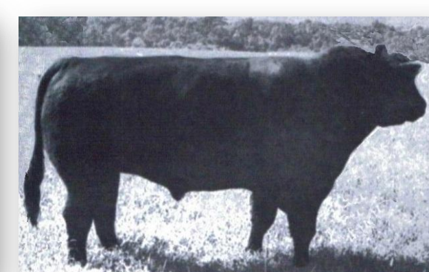
EMULOUS TN 70

Reg. AAA 4285114 (Big 70) was a 100% Certified Meat Sire with the distinction of being the only bull in the world of any breed to be both sired by a 100% CMS sire and to have sired a third-generation 100% sire. His dam the legendary Gaines Lady.