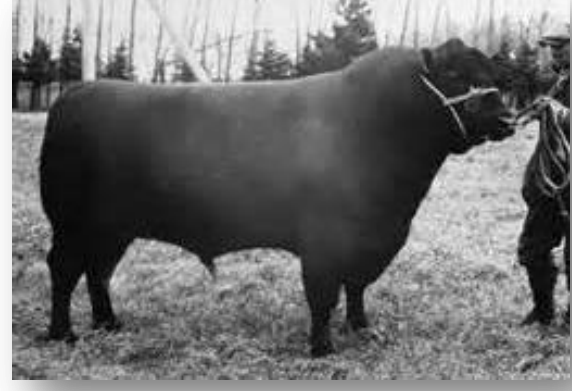
Glencarnock Revolution 6 'Considered the greatest son of Blackcap Revolution'