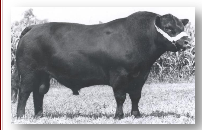
Bardoliermere 54 G M R A stout early 60's ABS catalog sire, recognized for his quality'

GENERATION / SIRE / REG. NO. / BIRTH DATE DAM'S NAME /DAM'S REG. NO. BREEDER / BREEDER'S ADDRESS