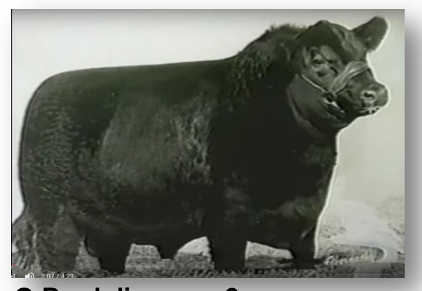
O Bardoliermere 2 'Known as the King of Sires' in his era