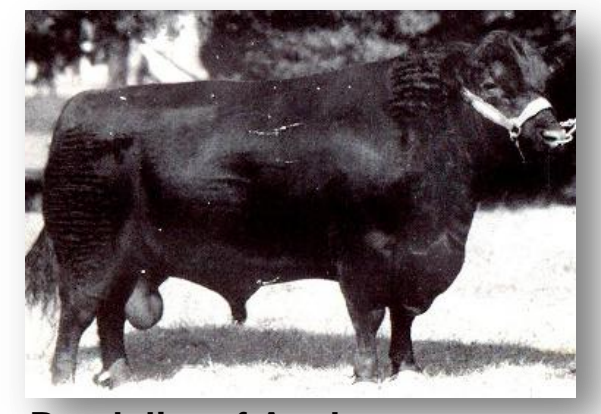
Bandolier of Anoka An Int'l show winner and important link for the Bandolier and Bardolier Lines