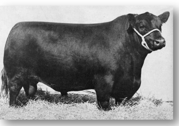
Ballot of Belladrum Reg. 2797832 Born: December 8, 1954